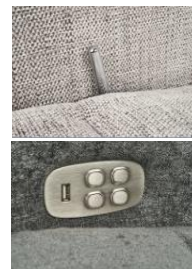
manual or powered operation